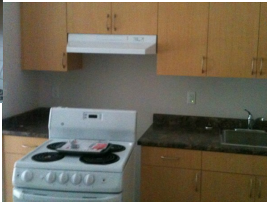
Kitchen in Four Feathers unit